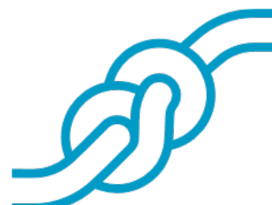
The 'sufficient ties test'

These tests can be complex, and we would advise any new entrant to the UK or person who spends time working in the UK to take professional advice to determine whether they are a UK tax resident.