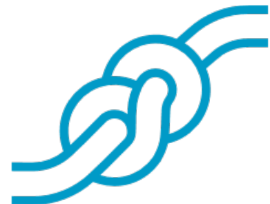
The 'sufficient ties test'

These tests can be complex, and we would advise any new entrant to the UK or person who spends time working in the UK to take professional advice to determine whether they are a UK tax resident.