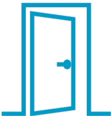
The 'automatic residence test'

If an individual is resident in the UK, then they are subject to UK tax laws. The UK Statutory Residence Test comprises of three tests to determine whether an individual is resident or not in the UK: