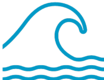
The 'automatic overseas test'